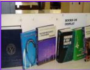
New Library books on display

The Harare Institute of Technology (HIT) Library welcomes you to its first issue of "HITLIB News" a quarterly newsletter aimed at communicating and showcasing information of interest to its stakeholders who are primarily students and staff of HIT. Such stories about Information Literacy Skills (ILS) training classes, new books, the digital library, new library services including upcoming events in HIT as well as national, regional and international workshops, conferences, symposia and some moments of laughter will feature prominently in the newsletter.