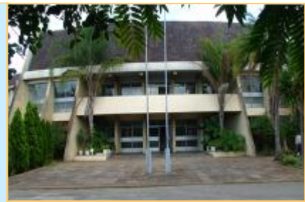
HIT THE TECHNOPRENEURIAL UNIVERSITY