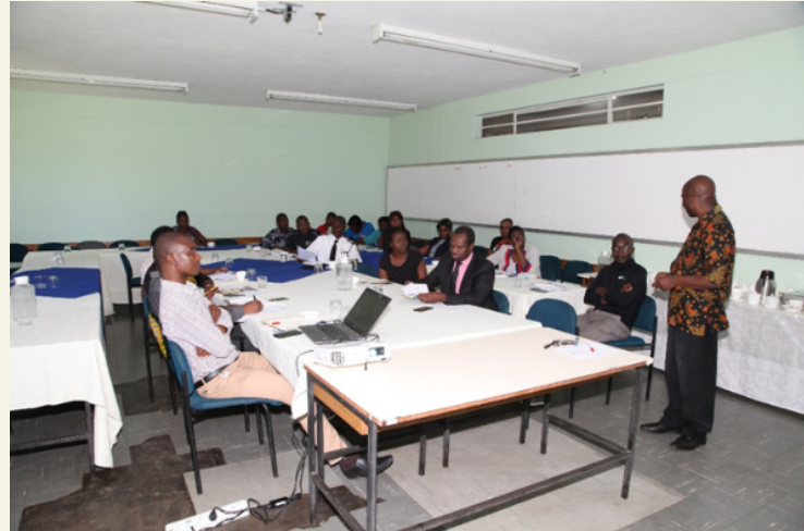
Dean, School of Business Conducts Financial Wellness Workshop