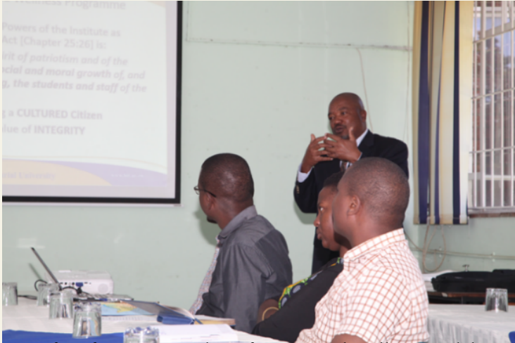
The Librarian Introduces the Financial Wellness Module